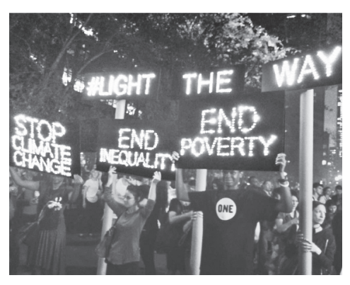
Light signs (top), Musicians (bottom)

"These events culminated in the 'Under One Sky' gathering at Dag Hammarskjöld Plaza of New York City. Large light installations radiated colorful rays through the trees and participants beamed flashlights, candles and cell phones to send a powerful message of hope for the future. Meanwhile, a broad spectrum of global speakers, youth activists and performers repeated clarion calls for urgent action, concluding with the P.S. 22 Youth Choir singing 'Light One Candle'."